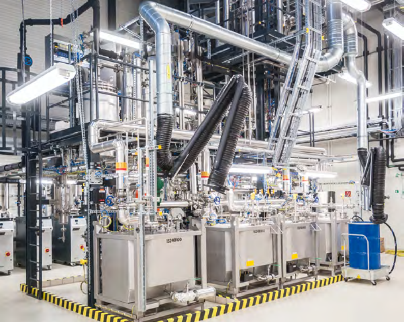
High-temperature vacuum distillation plant